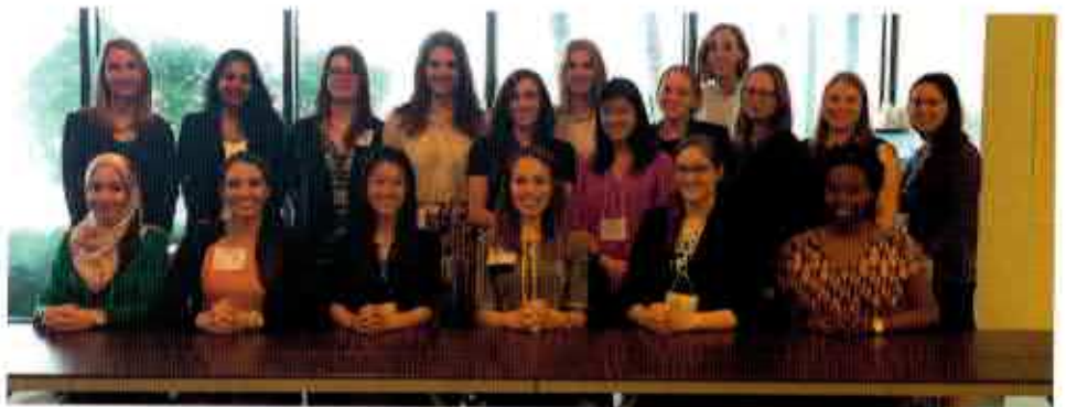
AMWA Student Leaders