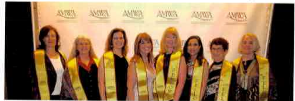
AMWA 2016 Fellows

AMWA meetings provide unique opportunities for networking with women physician leaders from across the country.