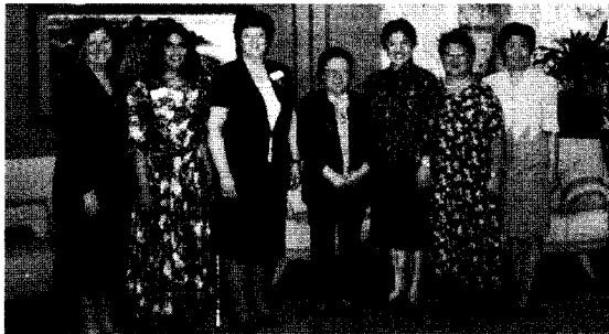
AMWA members shown meeting with representatives of the Chinese Medical Women's Association, including a former First Lady of China, He Jiesheng.

national and regional health care policy makers, government leaders, and dignitaries including the former First Lady of China, who