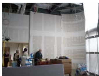
Lobby of new archives building