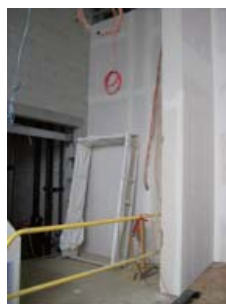
Future lobby of AMWA exhibit